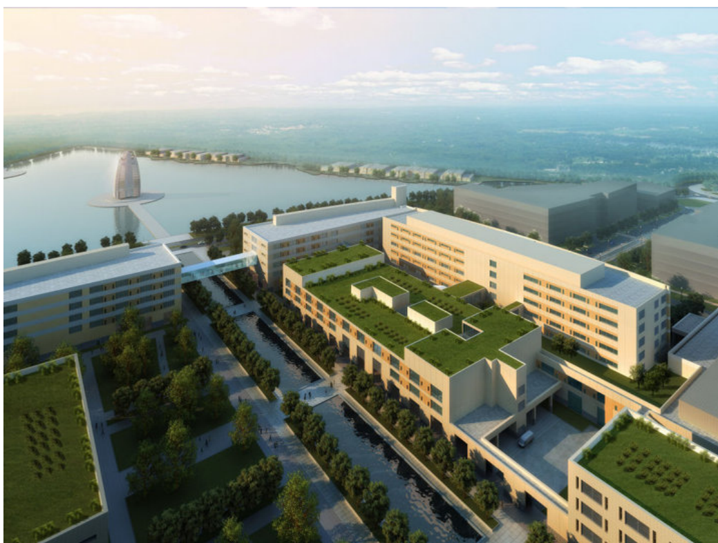
Fig 9: View of the temple and the medical campus