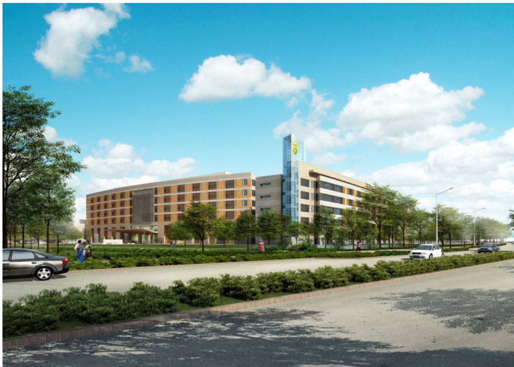
Fig 8: Vedanta University Medical College Main Building