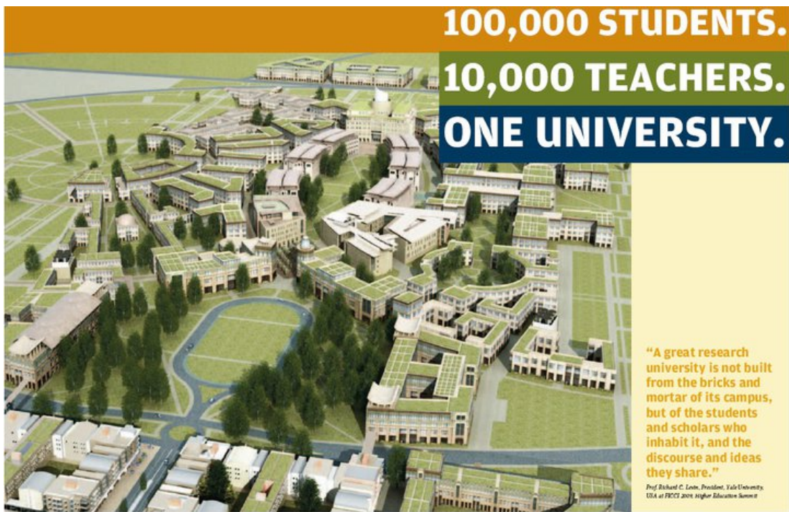
Fig 3: Vedanta University Phase 1 and 2; view from above