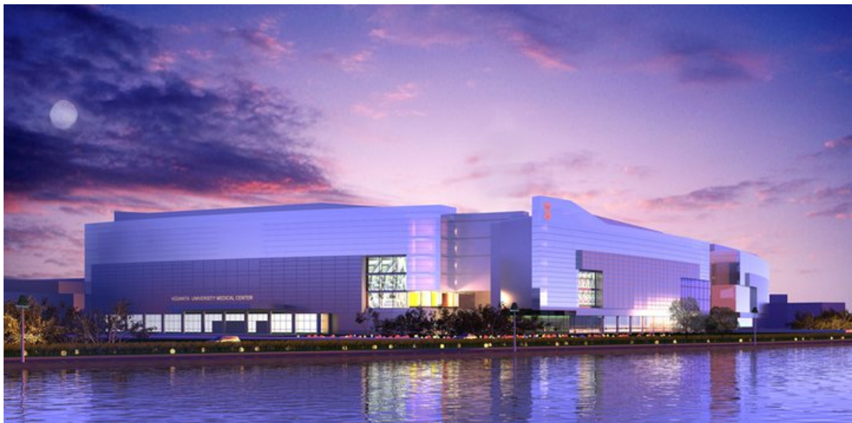
Fig 7: Vedanta University Medical College Main Building