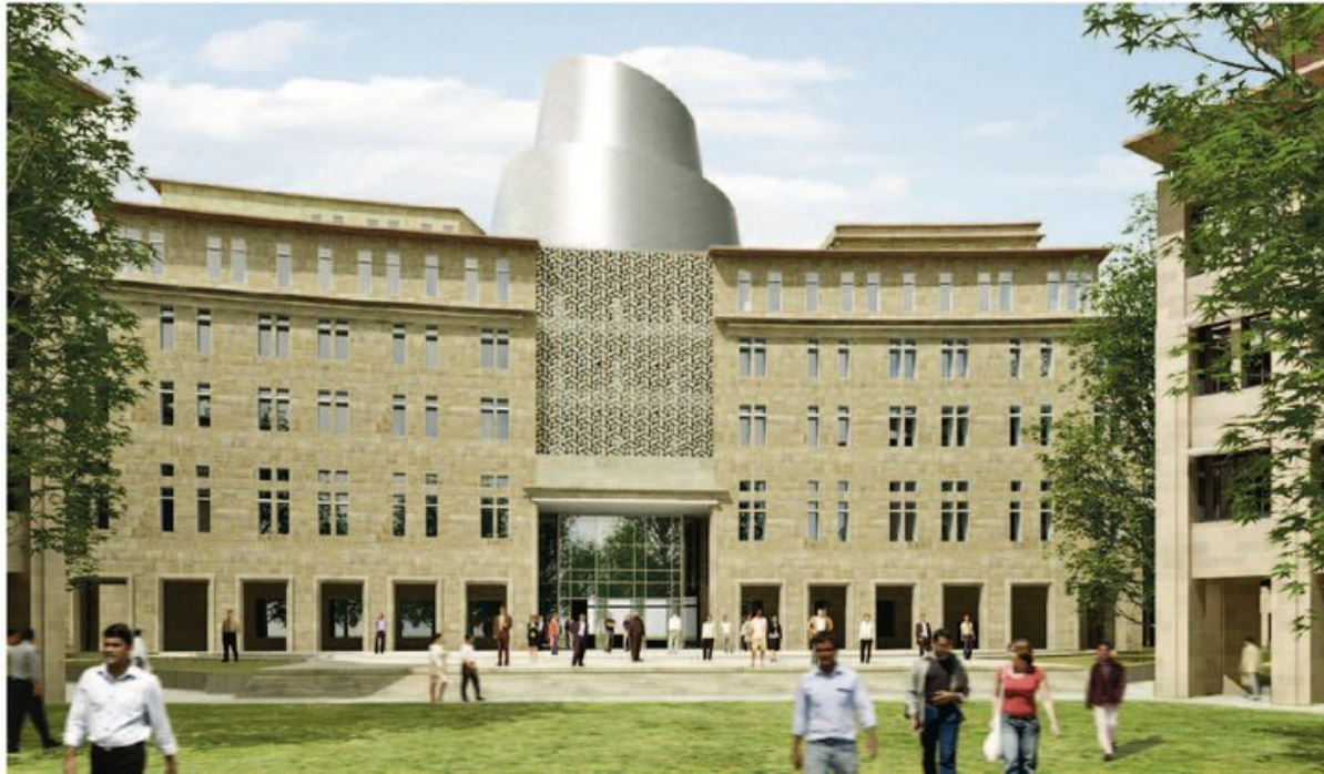
Fig 4: Vedanta University Signature Building

5. Vedanta University Medical College design has been made by LA based company Perkins+Will. [7,8]