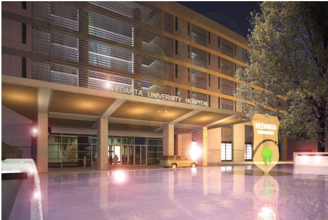
Fig 10: Medical College Entrance

6. Space planning for the medical college has been done by the international company Jensen Partners. [9]