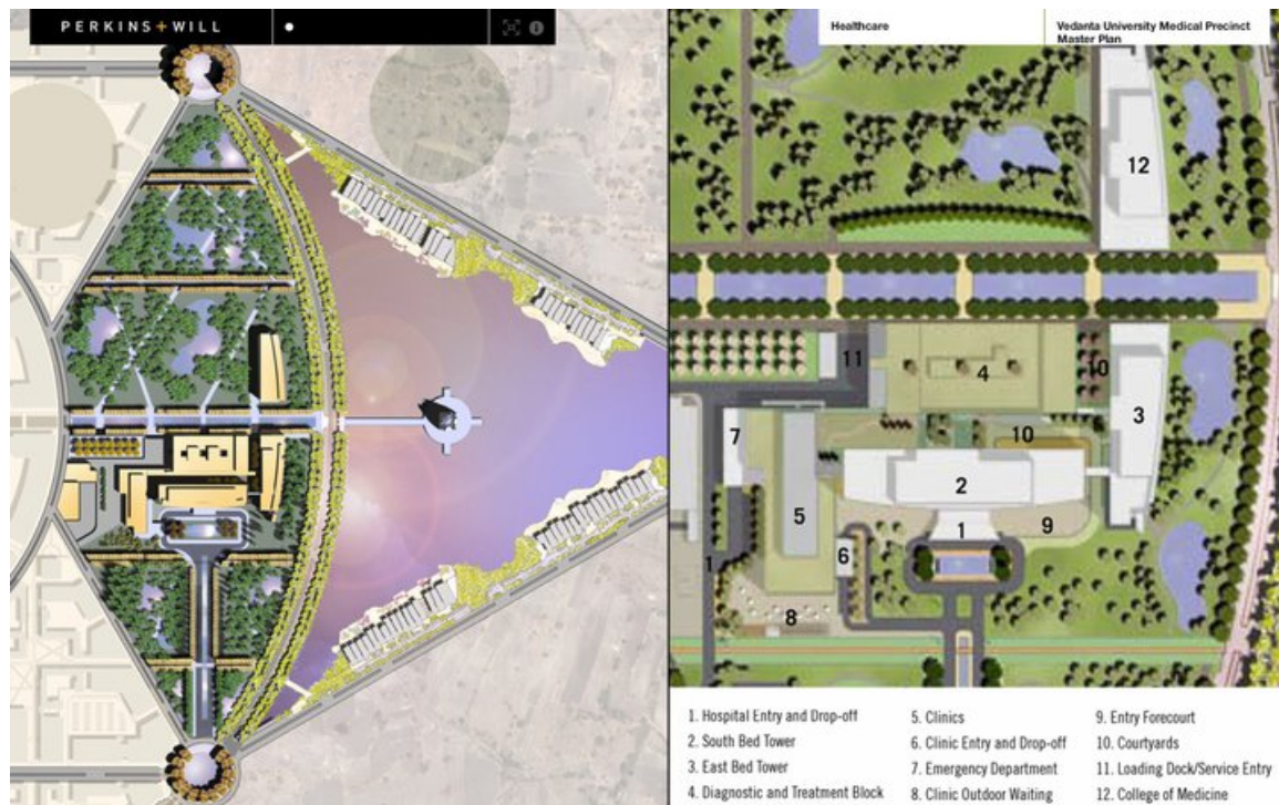
Fig 5: Vedanta University Medical Precinct masterplan

5. Vedanta University Medical College design has been made by LA based company Perkins+Will. [7,8]