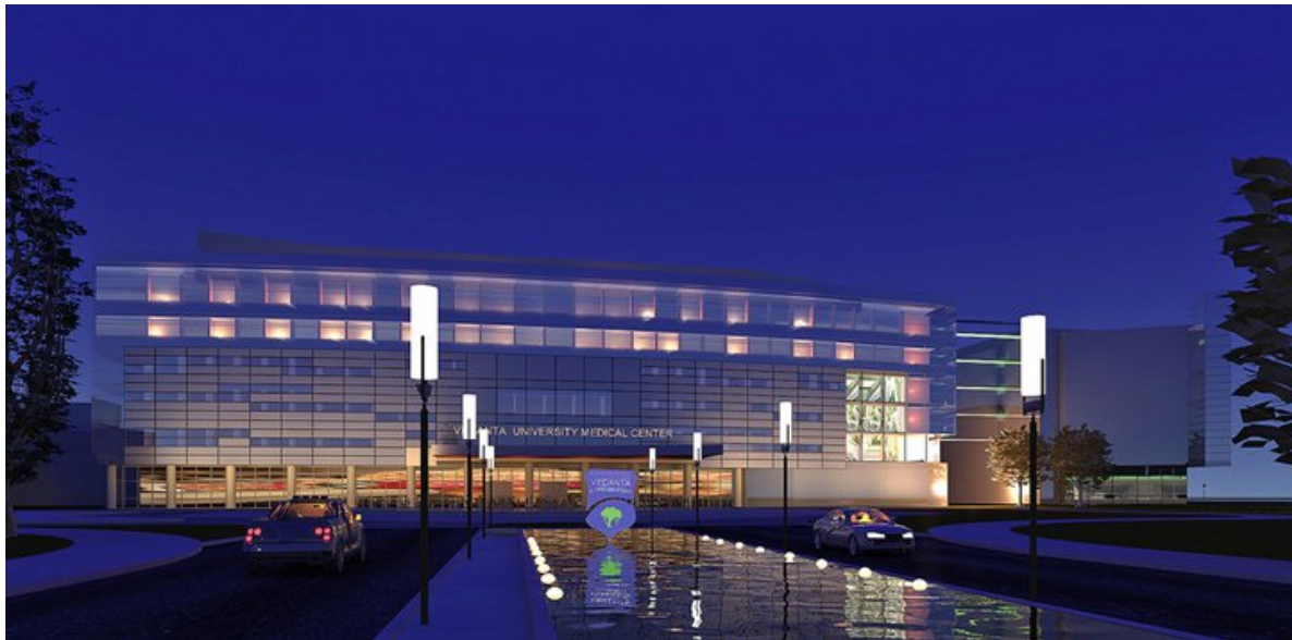
Fig 6: Vedanta University Medical College Main Building