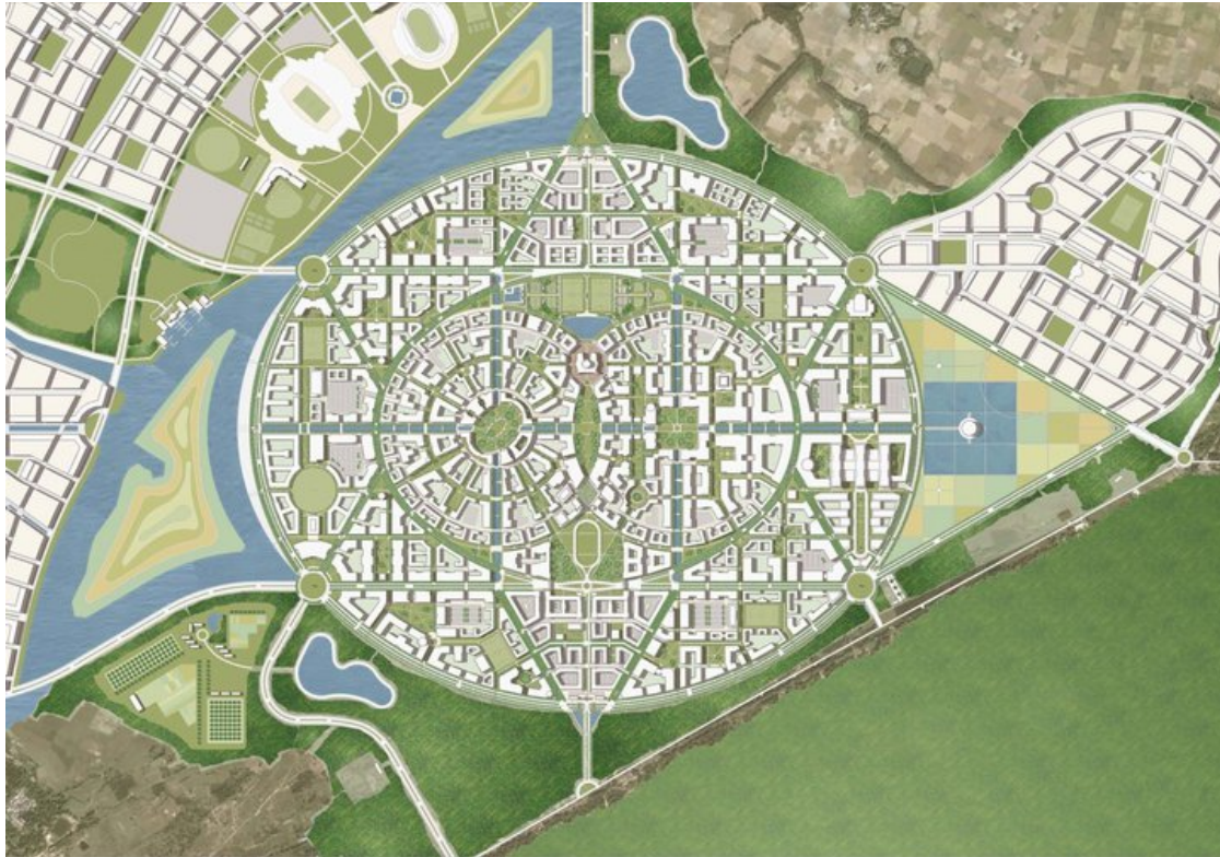
Fig 2: Vedanta University Academic area layout