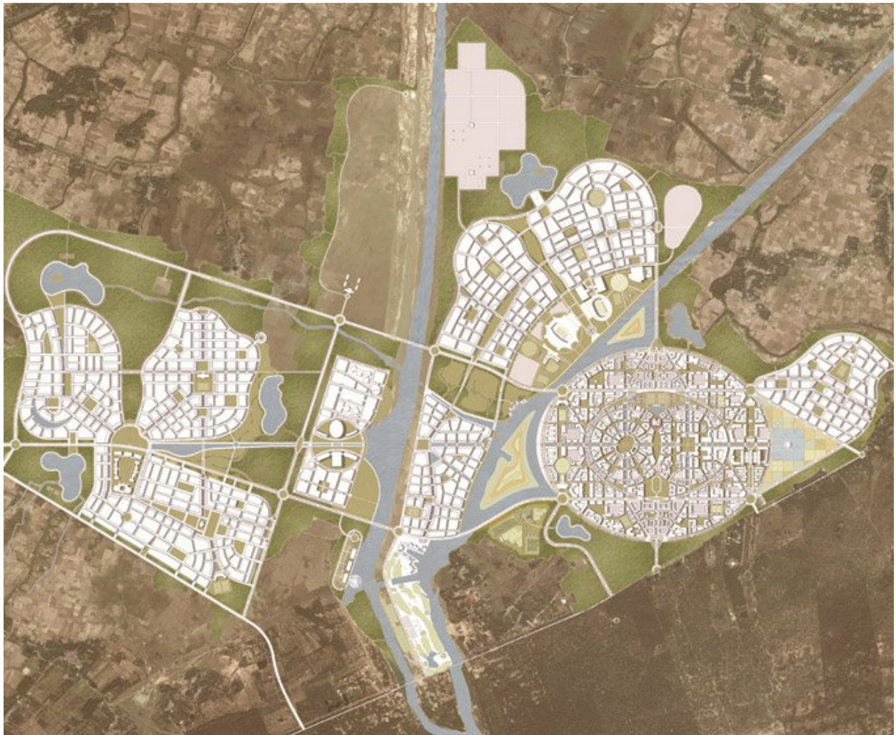
Fig 1: Vedanta University Master Plan layout